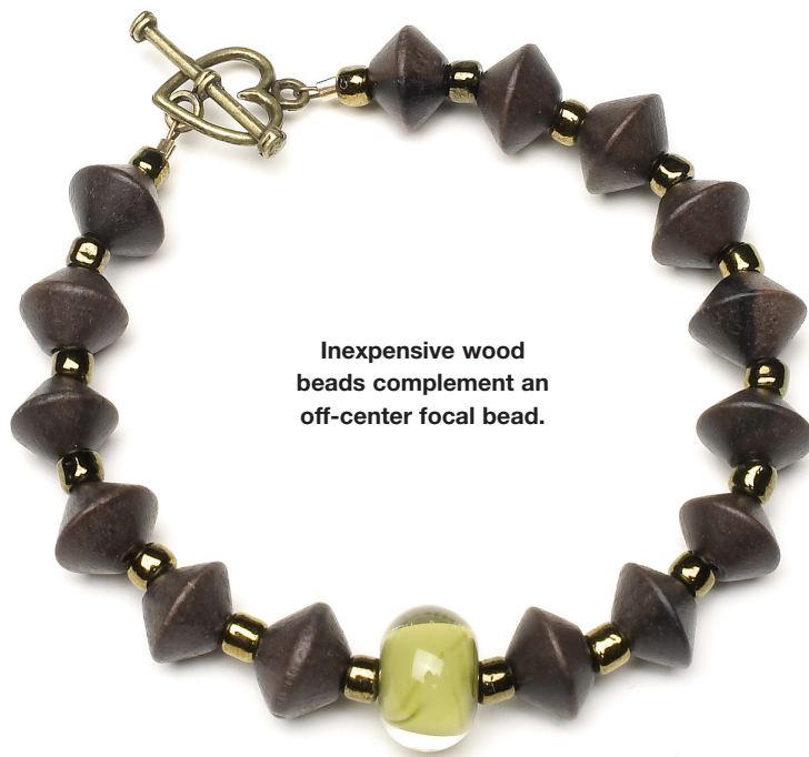
Inexpensive wood beads complement an off-center focal bead.