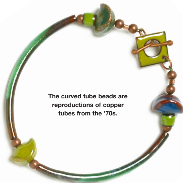
The curved tube beads are reproductions of copper tubes from the '70s.